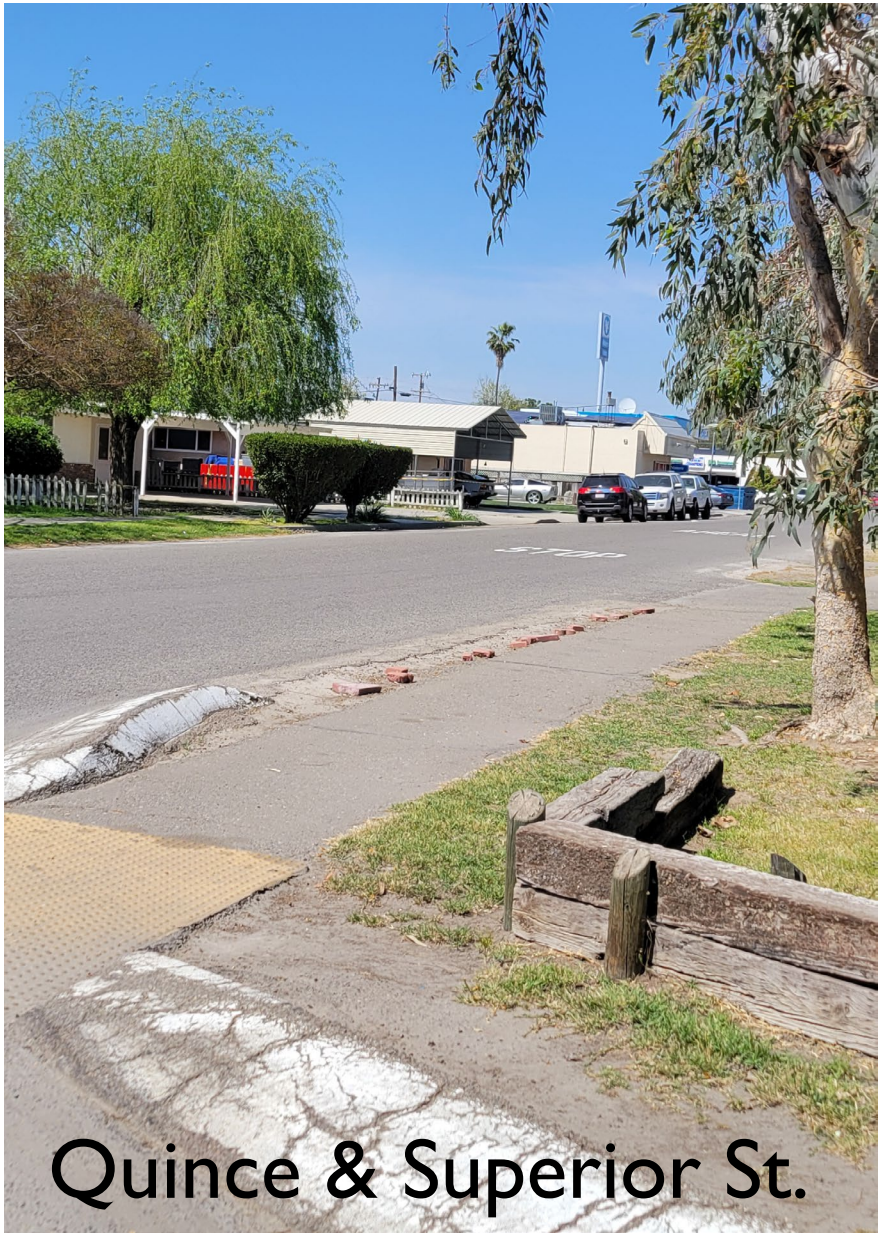
Quince & Superior St.