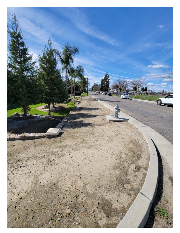
Figure 13: South side of Lincoln Ave. facing west from Lily Ave.