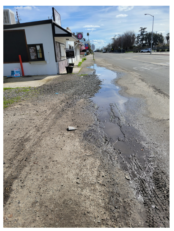
Figure 11: East side of Elm Ave facing south just south of Lincoln Ave.