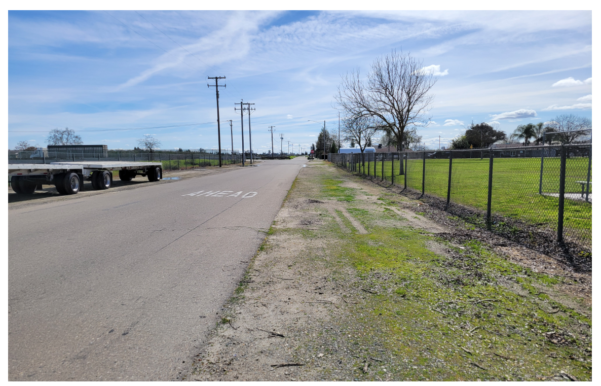
Figure 5: West side of Lily Ave facing south at elemenrtary school.