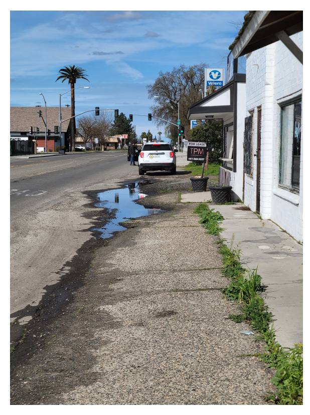
Figure 12: East side of Elm Ave facing north from just south of Lincoln Ave.