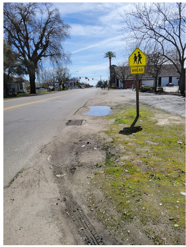
Figure 7: West side of Elm Ave facing south from Willamette Ave.