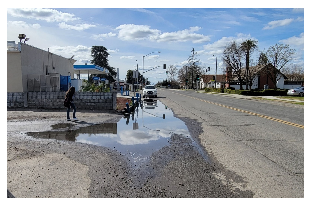
Figure 2: Student avoiding puddle on south side of Lincoln Ave near middle school.