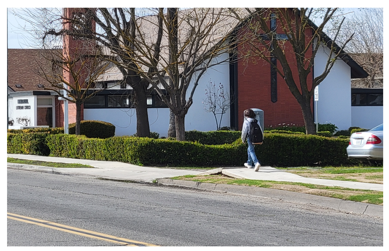
Figure 1: Student walking on buckled sidewalk on north side of Lincoln Ave near elementary school.