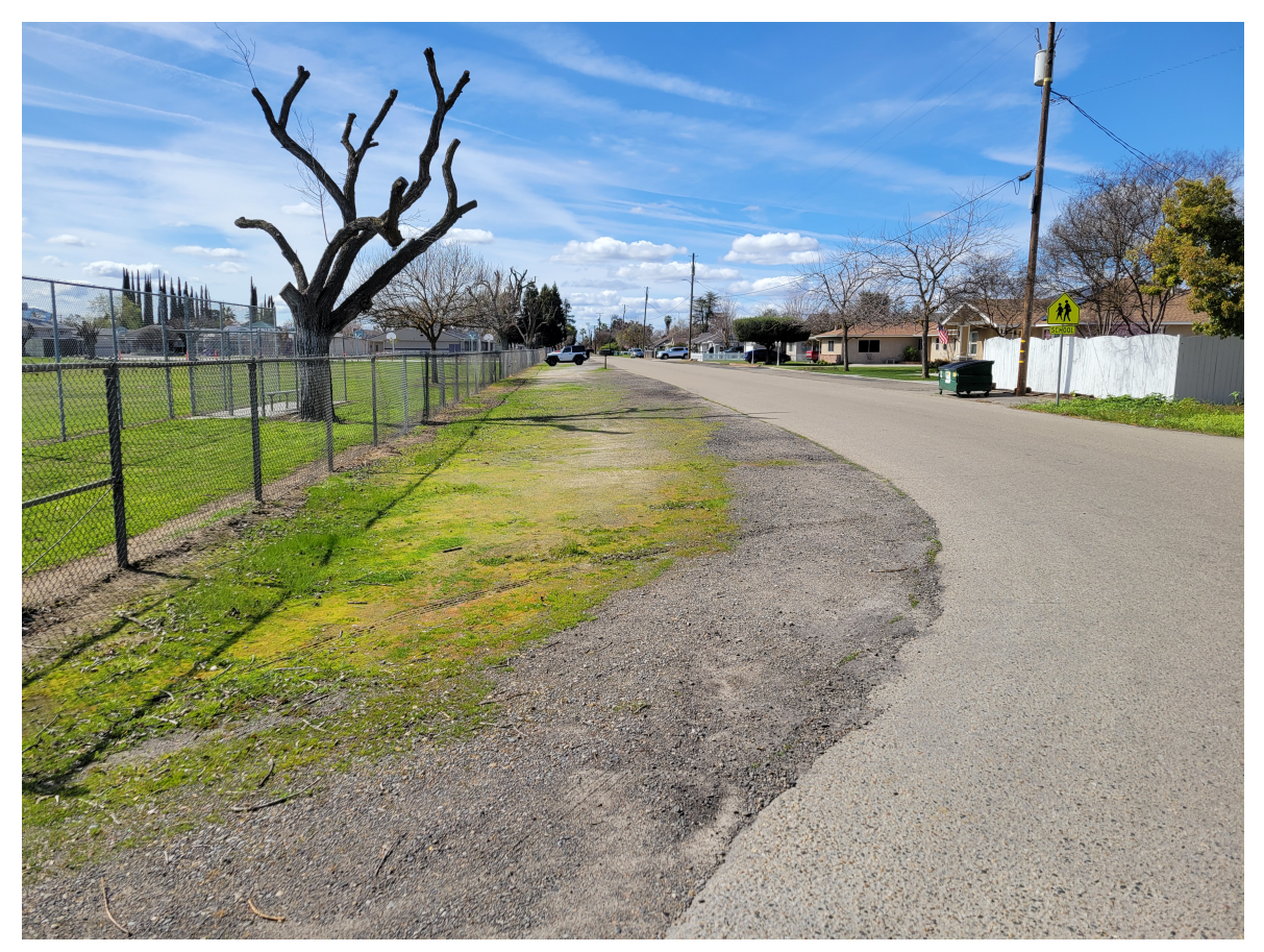
Figure 4: South side of Willamette Ave facing west from Lily Ave at elementary school.