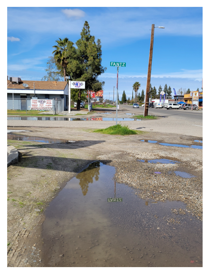
Figure 10: West side of Elm Ave facing north from Fantz Ave.