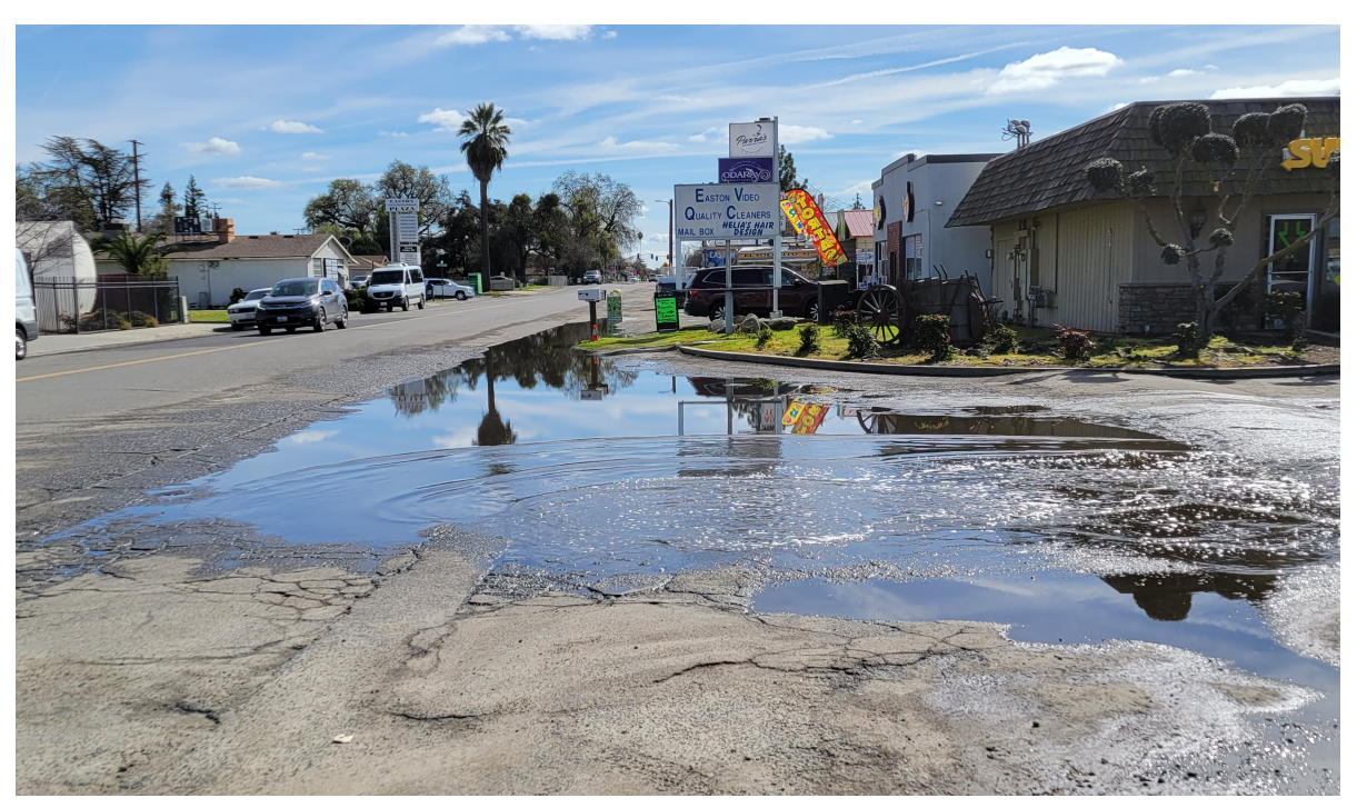
Figure 9: West side of Elm Ave facing south from Fantz Ave.