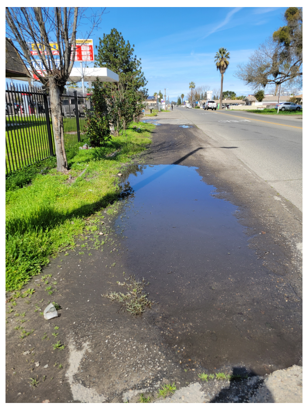
Figure 8: West side of Elm Ave facing north from Willamette Ave..