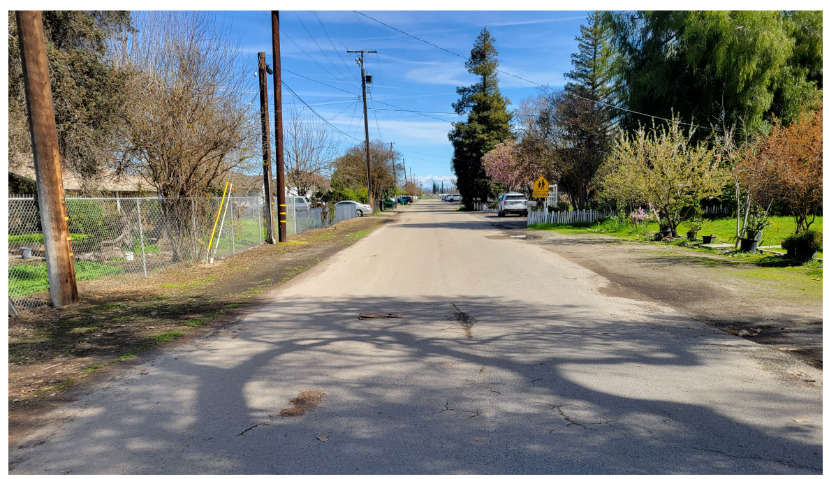
Figure 3: Willamette facing east from Elm Ave.