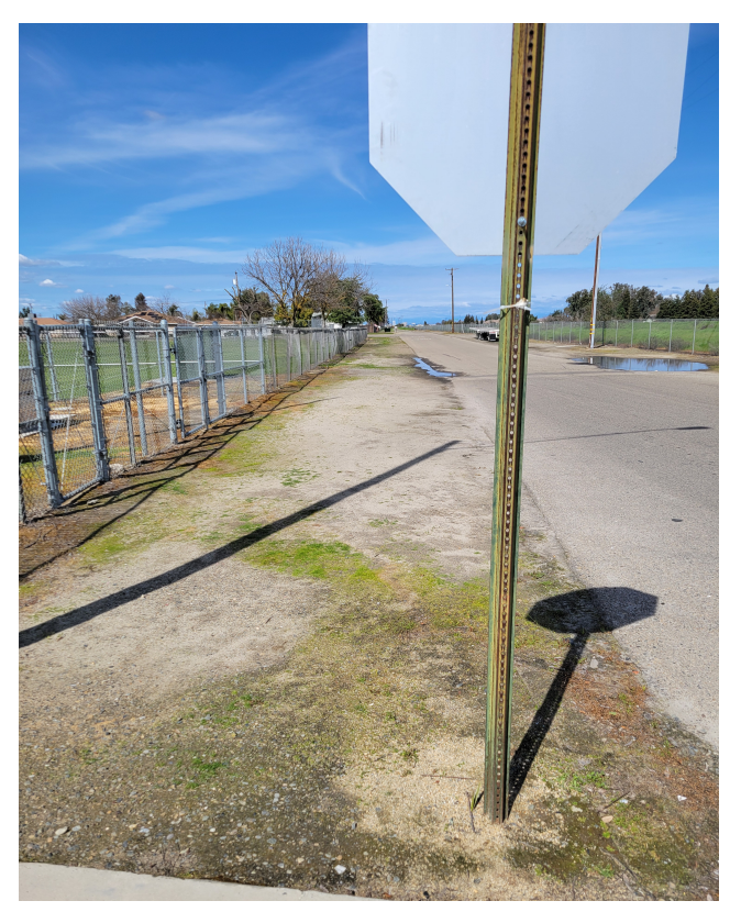
Figure 6: West side of Lily Ave facing north at elementary school.