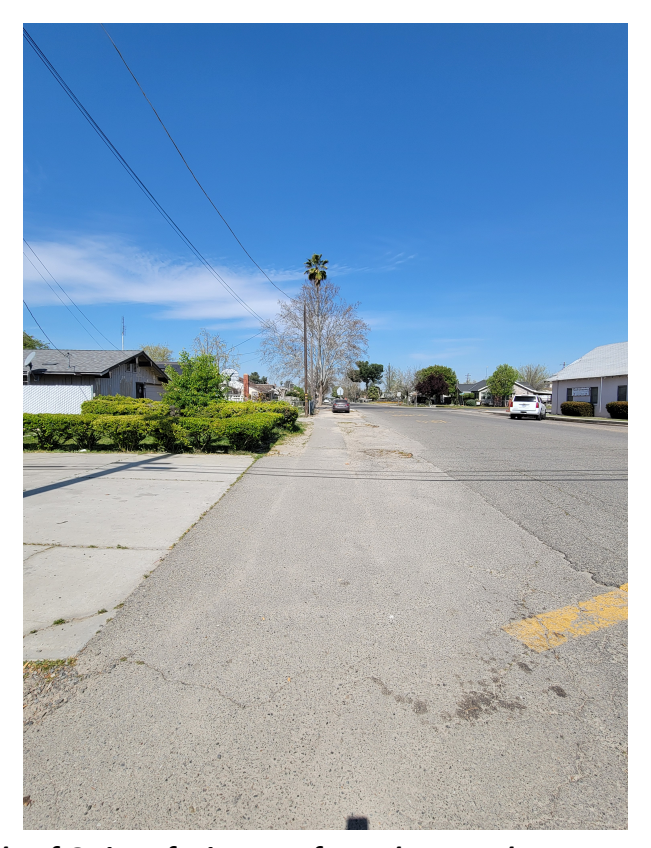
Figure 9: SW side of Quince facing NW from the NW elementary school entrance.