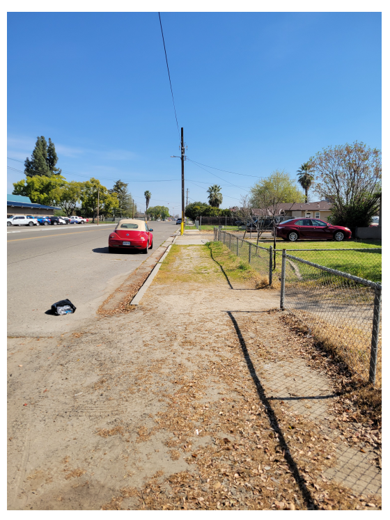
Figure 3: SE side of Tahoe Ave facing NE across from high school.