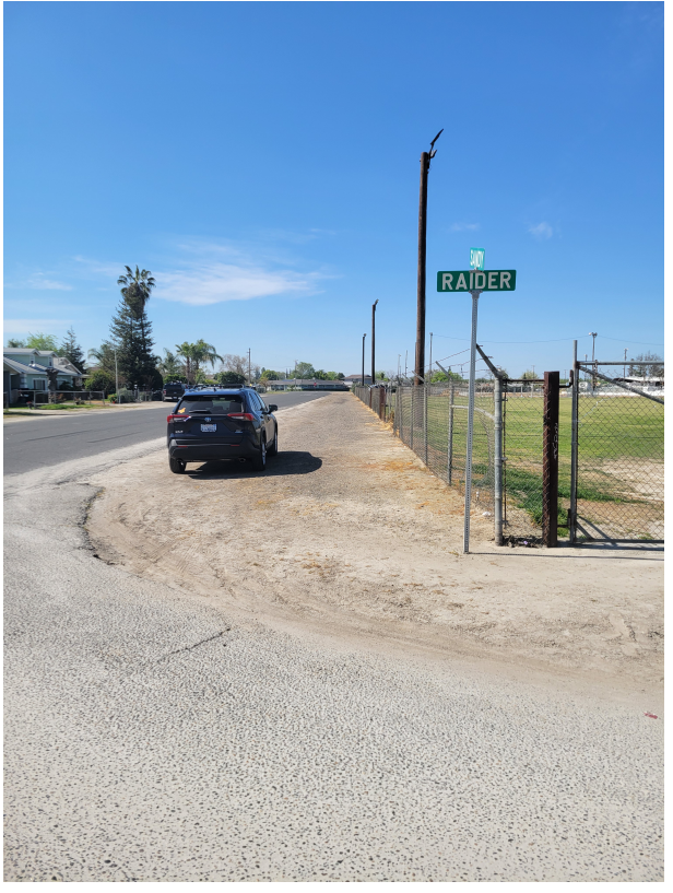
Figure 6: NW side of Sandy facing SW from the SW corner of Sandy and Raider Ave near the fairgrounds.