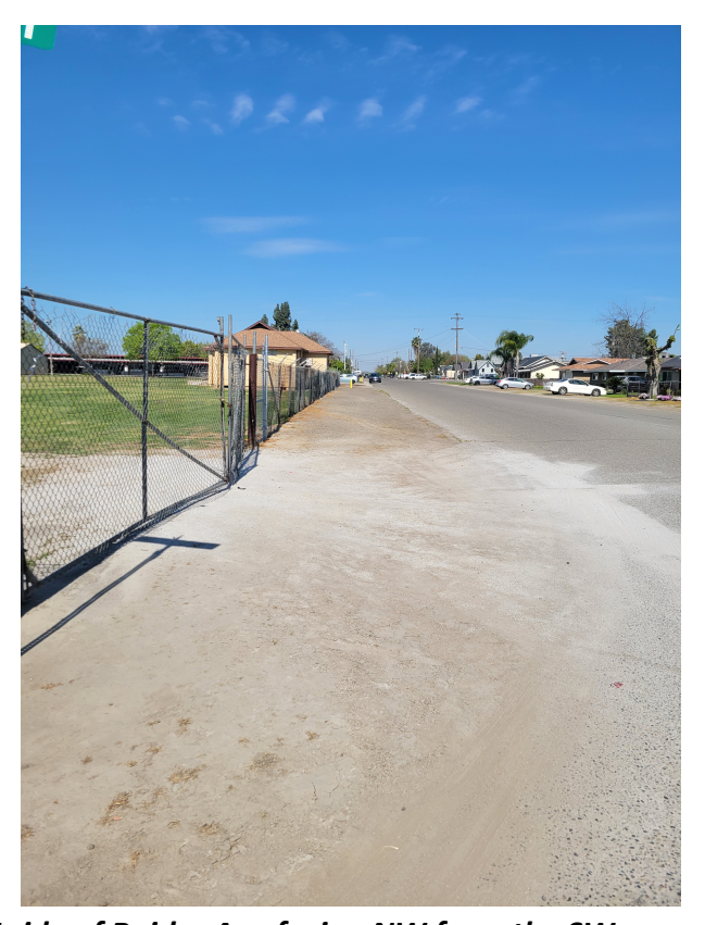
Figure 5: SW side of Raider Ave facing NW from the SW corner of Sandy and Raider Ave near the fairgrounds.