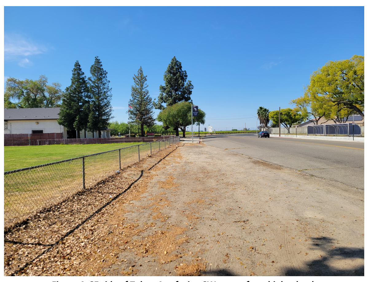
Figure 4: SE side of Tahoe Ave facing SW across from high school.