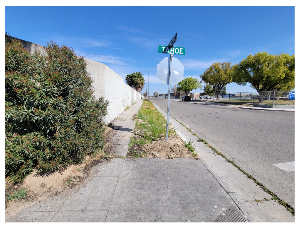
Figure 2: West side of Kincaid Ave facing north from SW corner of Tahoe Ave & Kincaid Ave near high school.