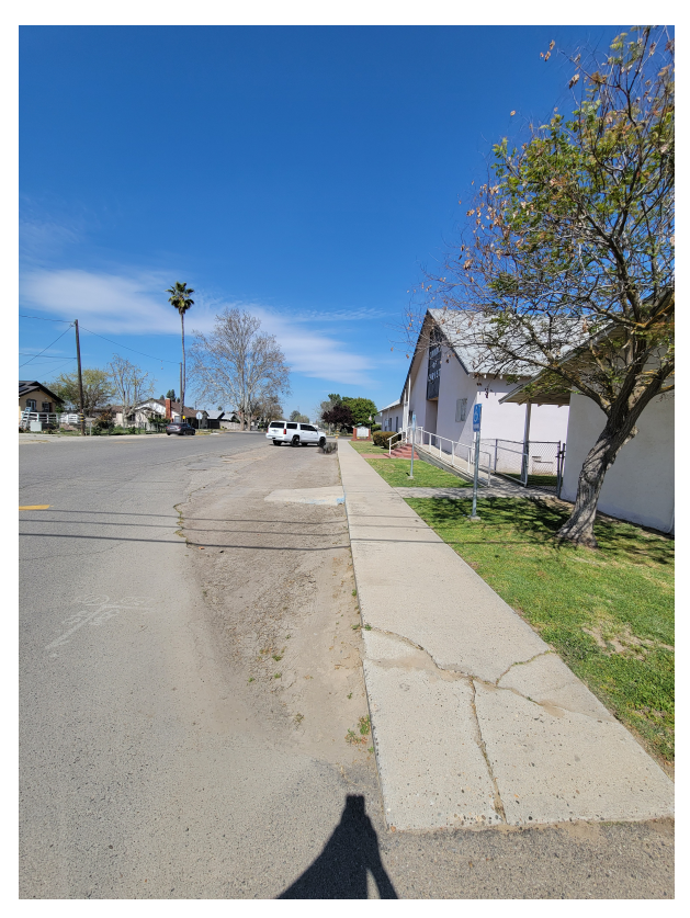
Figure 10: NE side of Quince facing NW from the NW elementary school entrance.