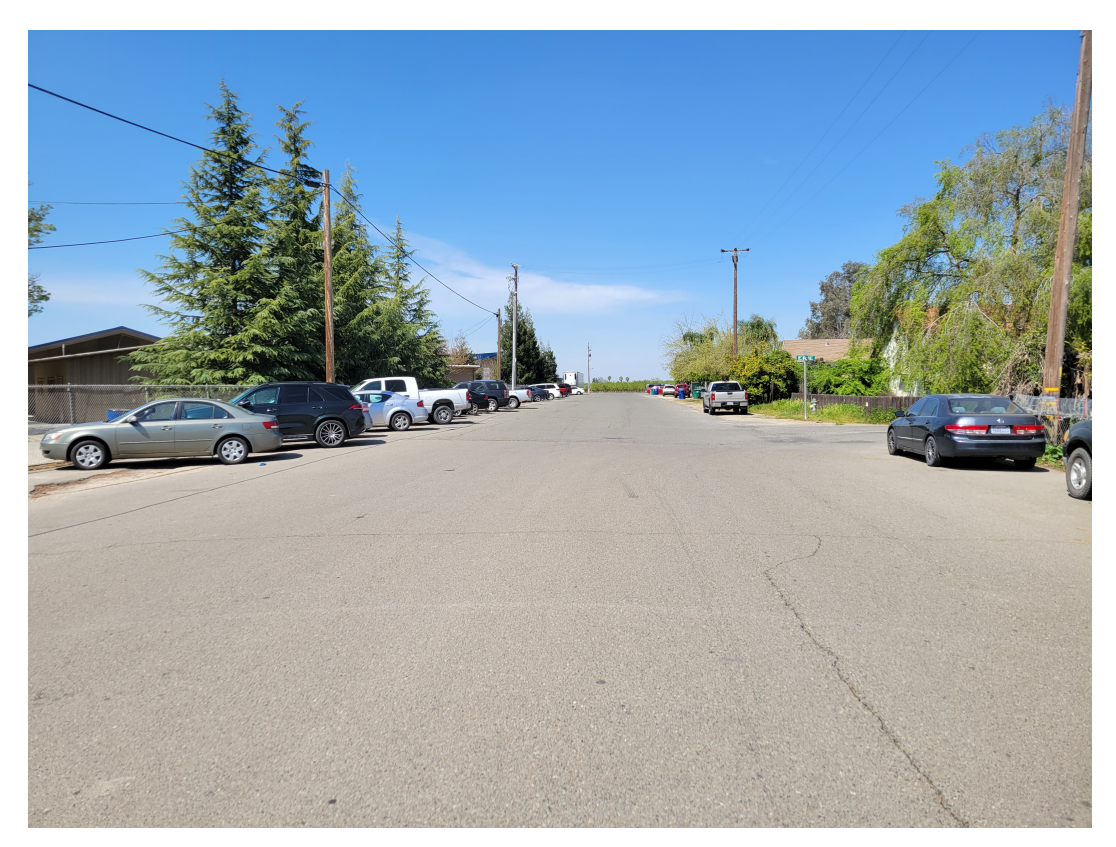
Figure 13: Raider Ave facing NW near the high school.