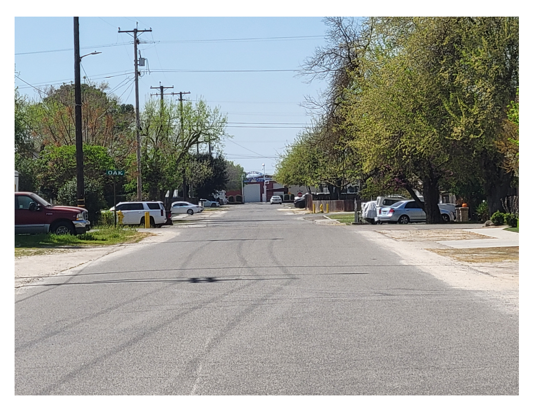
Figure 11: Superior Ave facing SW toward the fairgrounds.