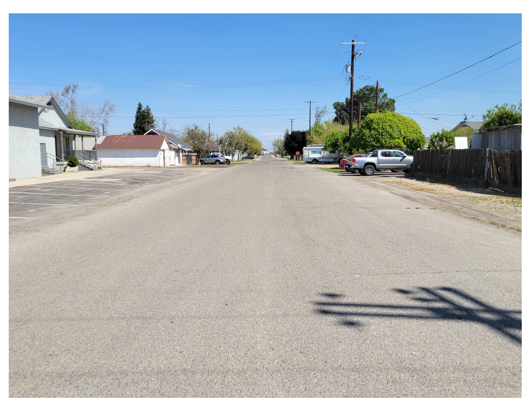
Figure 12: Superior Ave facing NE from Raider Ave (fairgrounds).