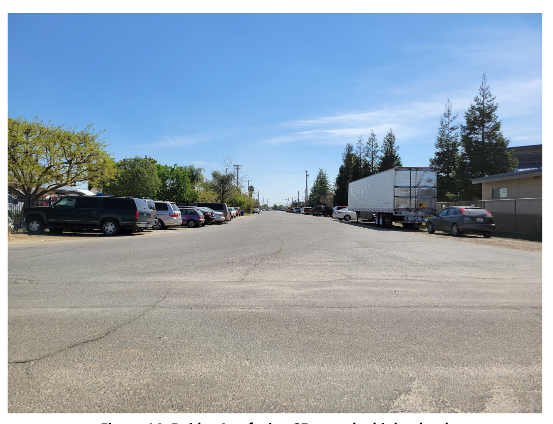
Figure 14: Raider Ave facing SE near the high school.