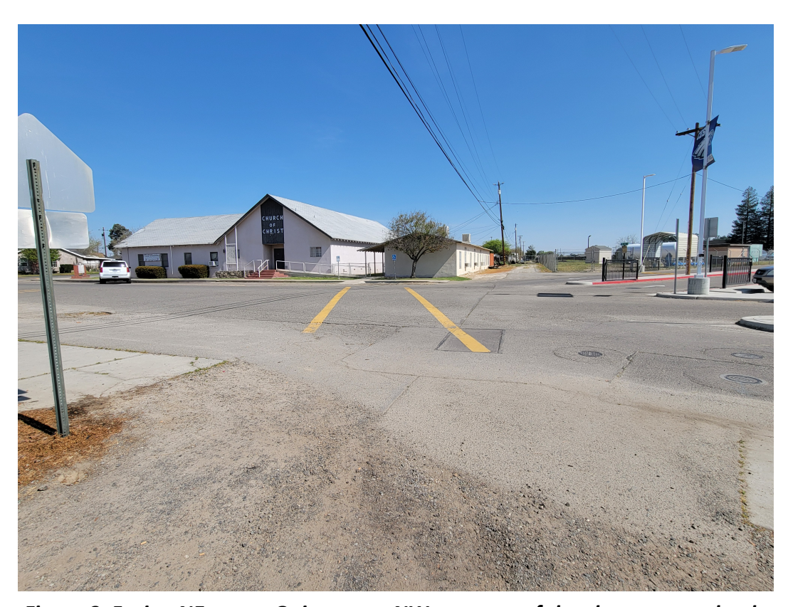
Figure 8: Facing NE across Quince near NW entrance of the elementary school.